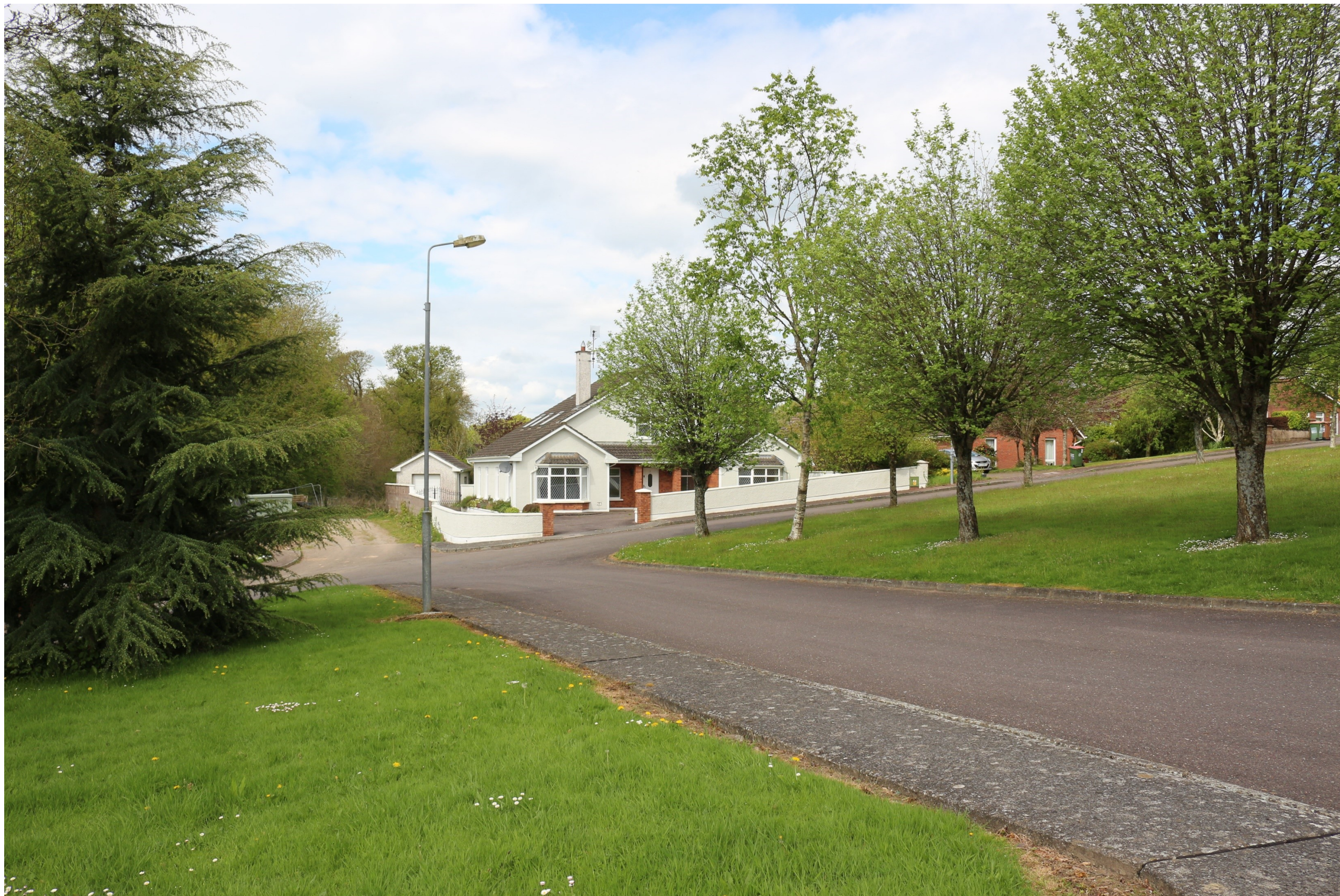
View 1. Existing.